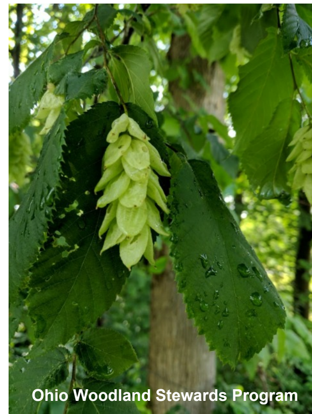
Ohio Woodland Stewards Program

Wednesday, September 29, 2021 10:00 am - 3:30 pm