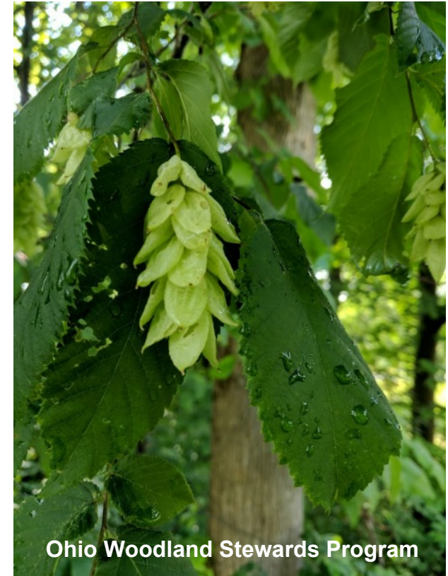
Ohio Woodland Stewards Program