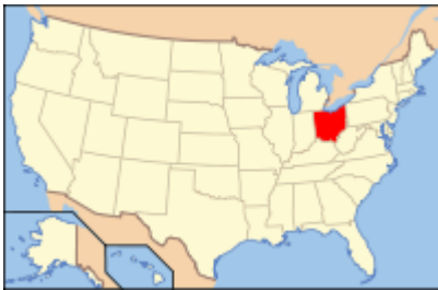
Ohio's location in the U.S.