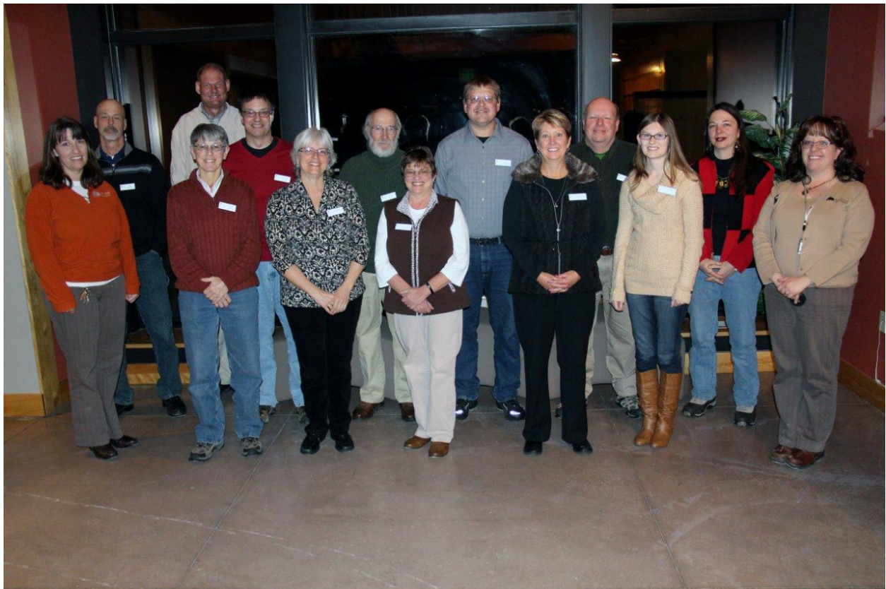
2013 Wood County OCVN Class Graduates

The Wood County Chapter is currently co-sponsoring the 2014 OCVN State Conference to be held at Camp Miakonda, in conjunction with the Lucas County Chapter.