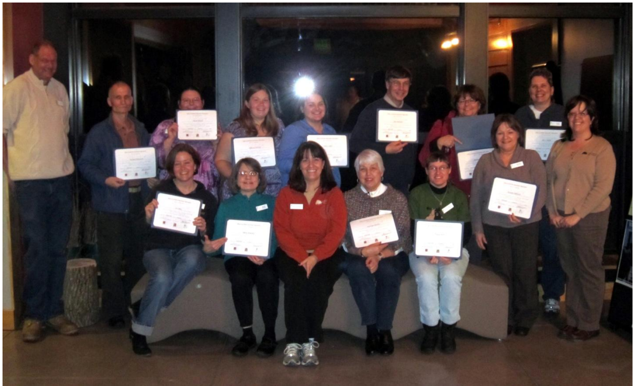
2012 Wood County OCVN Class Graduates