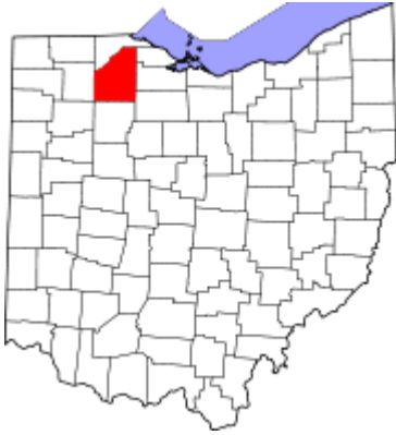
Location in the state of Ohio